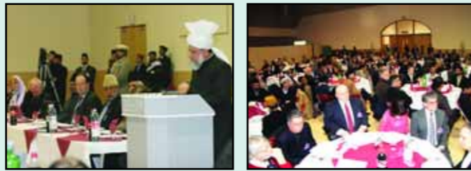
FREEDOM OF SPEECH AND TOLERANCE IN ISLAM SEMINAR

There are over 90 branches of the Ahmadiyya Muslim Community throughout the UK and they actively work to spread the peaceful message of Islam. It is our belief that tolerance and respect are the foundations of a peaceful society and we are committed to working with people of all faiths to enable everyone to practise their religion without hindrance. We are also dedicated to serving society, whether it is through raising funds for charitable causes or by giving our time to make our neighbourhoods cleaner, we believe it is our duty to serve our country in every way we can.