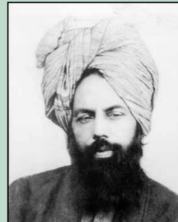
Hadhrat Mirza Ghulam Ahmad The Promised Messiah and Mahdi

One of the greatest bounties of the Ahmadiyya Muslim community is that it has been blessed with the institution of Khilafat in Islam. Khilafat, (God's vicegerent, or successor to a prophet) – the spiritual system of leadership – was reinstated by the Promised Messiah (as) and after his demise it has served to unite the community on one platform. The first successor of Hadhrat Ahmad (as) was Hadhrat Maulvi Nooruddin (ra), a renowned scholar of the Holy Qur'an and an eminent physician. In 1914, he was succeeded by Hadhrat Mirza Bashiruddin Mahmud Ahmad (ra) – a renowned scholar of Islamic studies who also enjoyed a vast knowledge of other religions. He led the community for 51 years and firmly laid the administrative structure of Ahmadiyyat as an international community. The third successor was Hadhrat Hafiz Mirza Nasir Ahmad (ru), a distinguished educationalist, who placed great emphasis on service to Africa. In 1982, Hadhrat Mirza Tahir Ahmad (ru) was elected as the fourth successor. His leadership projected the wonderful teachings of Islam into the 21st century on a truly global scale through numerous community projects and the creation of a unique satellite television channel.