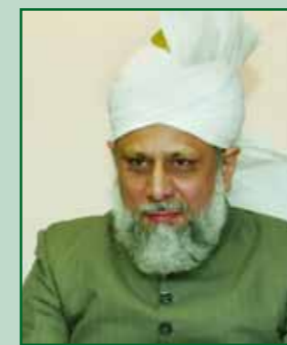
Hadhrat Mirza Masroor Ahmad Head of the worldwide Ahmadiyya community

The Ahmadiyya community is now passing through another golden era of a fifth Khalifa, Hadhrat Mirza Masroor Ahmad, who holds the worldwide Ahmadiyya community together as one. He ensures that every step taken is in the right direction, fulfilling the mission of the Promised Messiah (as). The Khalifa is particularly dedicated to ensure that Islam is viewed and understood as a religion of peace throughout the world. He has repeatedly emphasised the fact that Islam rejects violence in any form and for any reason as it is completely at odds with Islam – a word which itself means peace.'